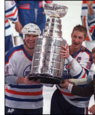
May 26, 1988 - The Edmonton Oilers win their fourth Stanley Cup in five years.