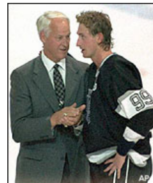
Mar. 23, 1994 - Gretzky scores his 802nd career goal, surpassing childhood idol Gordie Howe.