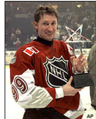
Jan. 24, 1999 - Gretzky wins his third career All-Star MVP award.