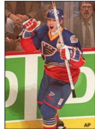
Apr. 29, 1996 - Wayne get his first goal as a St. Louis Blue.