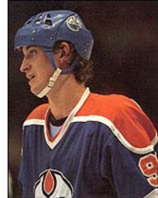
Apr. 2, 1980 - Gretzky becomes the youngest player to score 50 goals.