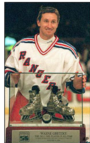
Jan. 9, 1998 - "The Hockey